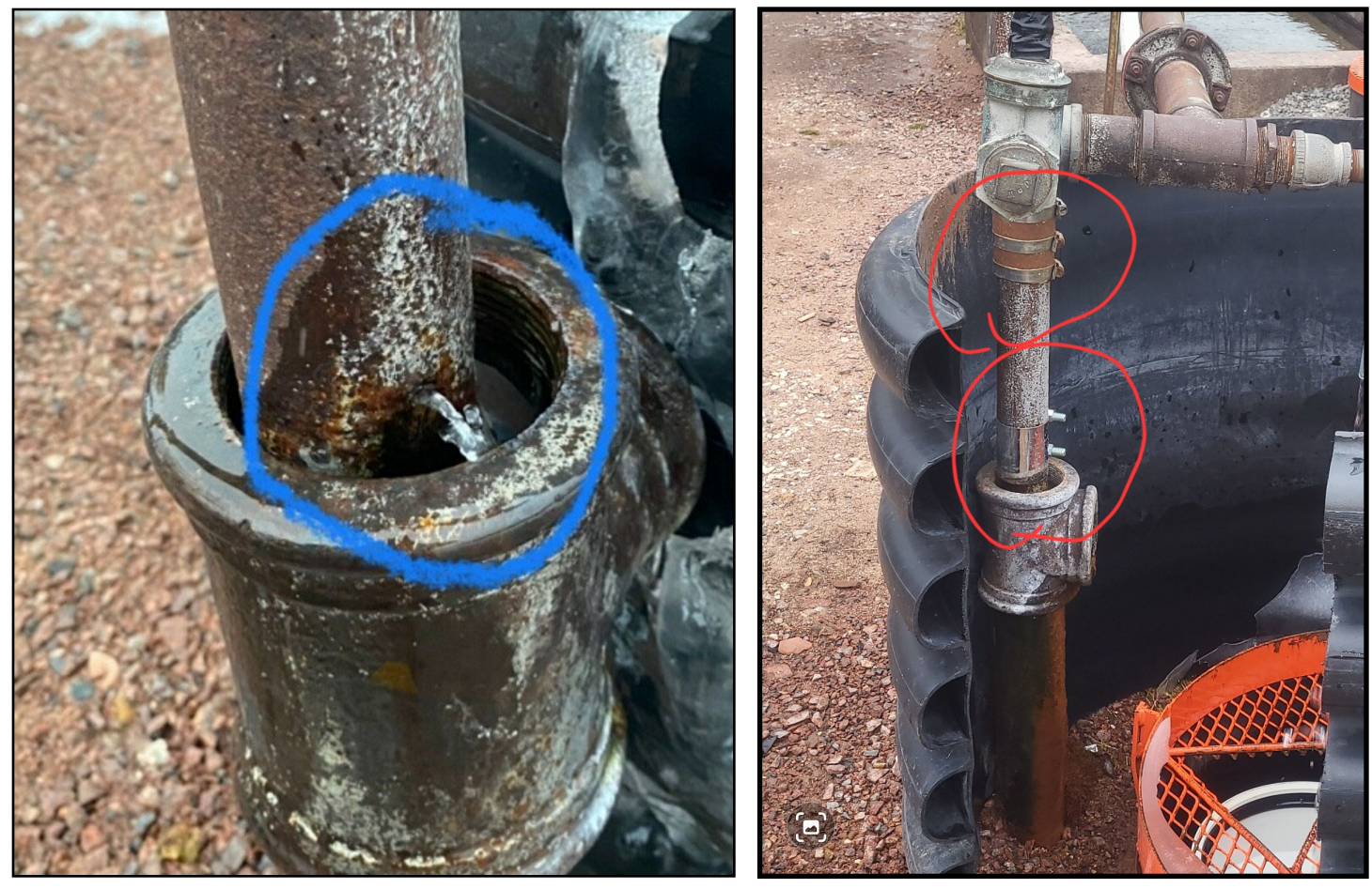
The artesian well at West End sprung a leak and the repairs have not fixed the problem.