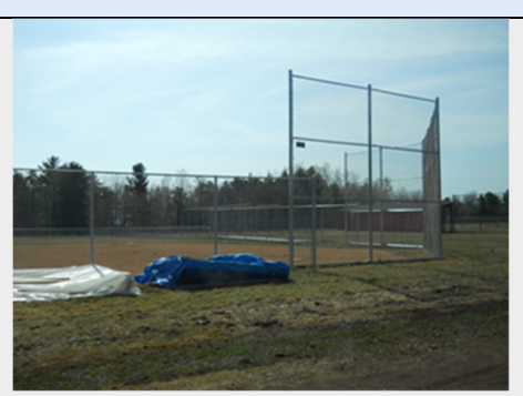
Athletic Field & Skate Rinks 14.73 Acres

Located between E. Memorial Park Dr. and E. Pumphouse Rd. The property includes regulation softball, baseball, and Little League fields, two ice skating rinks, warming house, restrooms, and a concession stand. A groomed snowmobile trail also bisects the property.