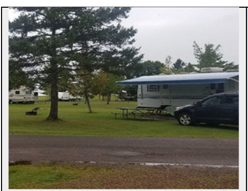
Thompson's West End Park 21.88 Acres

Park and campground located at the foot of 8<sup>th</sup> Ave W. Site features include 50 campsites with utility hookups, showers, restrooms, dump station, two artesian wells, festival area, picnic area and shelter, swimming beach, playground, fishing pier, boat launch and docks.