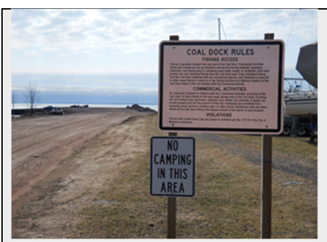
Commercial Dock 2.04 Acres

Public access site at one of the last working bulk cargo docks on Chequamegon Bay. Site features a mooring bollard for commercial boats, fishing area and a small beach. This site is also a popular winter access to Chequamegon Bay.