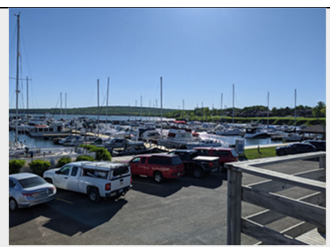
Washburn Marina 18.11 Acres

Full-service marina located 3 blocks from the City's commercial district, just west of the Commercial Dock. The Marina offers a variety of services including dockage, bulk cargo storage areas, boat ramps, a 150-ton boat lift, indoor and outdoor vessel storage, and vessel repair.