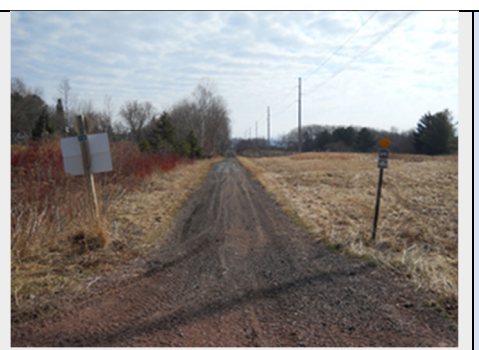
Old Railroad Trail 35.56 Miles

The City of Washburn purchased the majority of the former Chicago and Northwestern Railroad right-of-way within the city when the railroad abandoned service to the area in 1983. The right-of-way under municipal ownership has been converted into an off-road snowmobile and ATV trail.