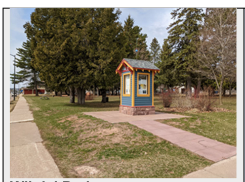
Wikdal Park 1.16 Acres

Community gateway park located at the intersection of W. Bayfield St. and N. 3rd Ave W. Site features benches, lighting, informational kiosk, picnic tables and flower gardens. This park hosts a number of community events during the year.