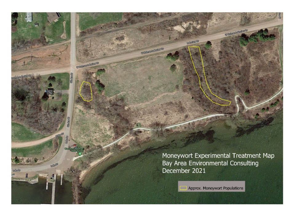
Figure 1. Map of the moneywort populations present on the Washburn lakeshore, on property owned by the City of Washburn. The boundaries are approximate. Twenty plots would be randomly placed throughout these areas where moneywort is present.