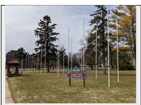
Legion Park 1.58 Acres

Park and public open space located along E. Bayfield St. and N. 1<sup>st</sup> Ave E. This site houses the city's veterans memorial and features flag poles, flower gardens, pathways, and benches.